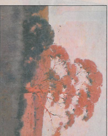
Featured artist: A David Lake landscape is just one of the many delights to be found at Artfest this year.